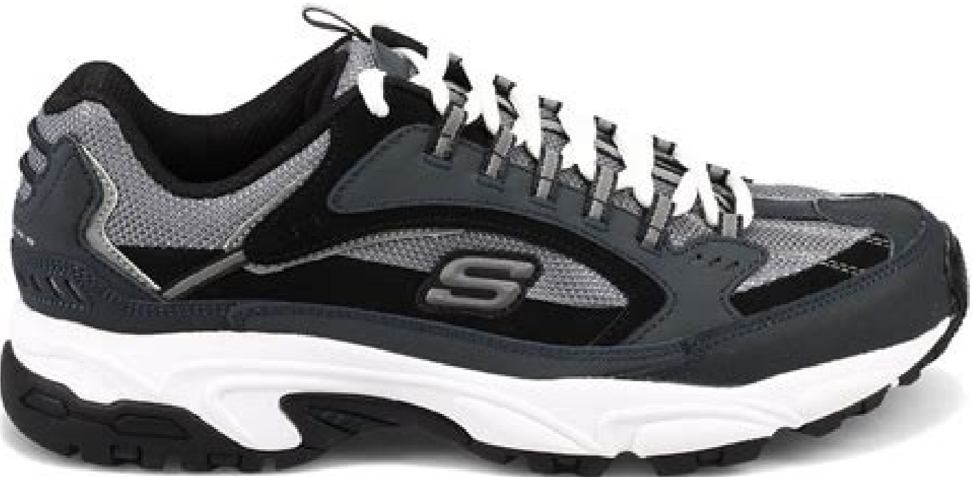
Does under armour have wide width shoes. Men's under armour shoes wide width. Mens running shoes in wide widths.